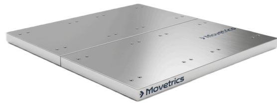
Movetrics F1 3D Dual