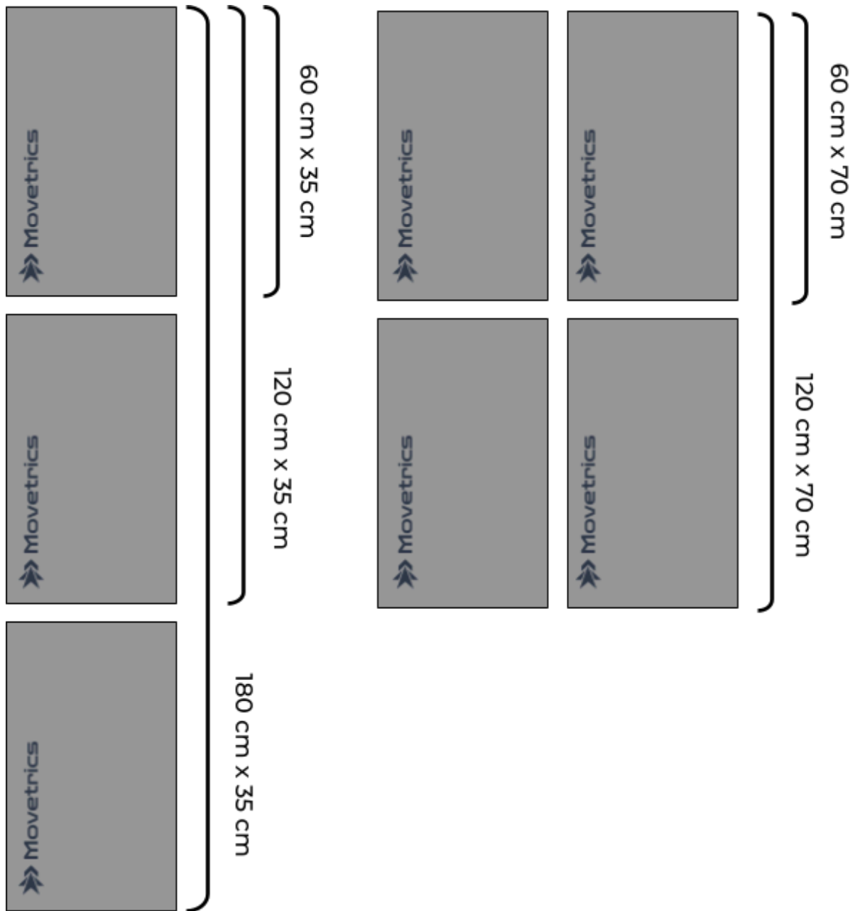
Examples of possible layouts in cm

Plates can be arranged side-by-side, front-to-back, or in offset patterns – giving you full flexibility for assessing real-world movement patterns. Up to ten units can be used in perfect sync, with all data streamed and timestamp-aligned for unified analysis.